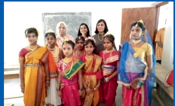
Happy faces from a district school in Nutanhat, West Bengal. One of FWCA's CSR initiatives.

FWCA has strived to build positive bridges with communities that benefits public at large. We see CSR as an opportunity to use our skills, expertise, knowledge and relationships to make a positive difference to individuals, society and the environment. We also make a difference through active involvement in our communities. Our community programmes focus mainly on education and entrepreneurship.